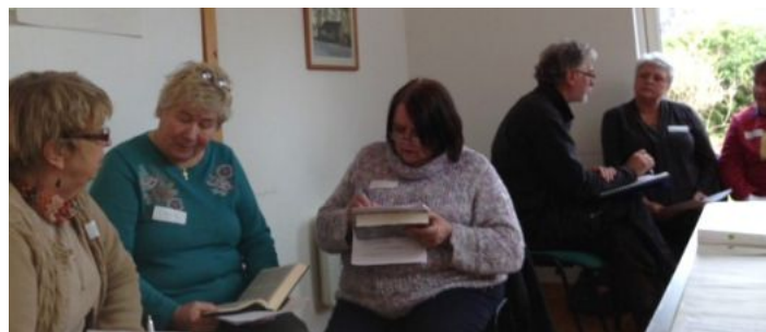
Bible Study & Clearing up

There was much animated discussion on the themes presented, and suggestions for future study include the oral tradition of Celtic women saints, the work of Marilynne Robinson, and the writings of women within the Free Church in Lewis, at the time of the Prayer Revivals in the Nineteen fifties.