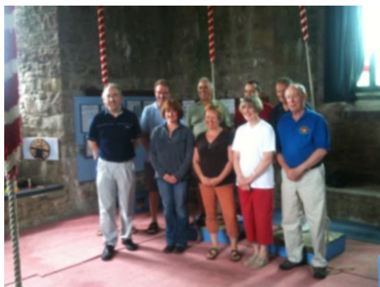
The successful band