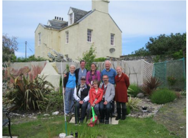
South Kintyre Ministers' Fellowship on Gigha