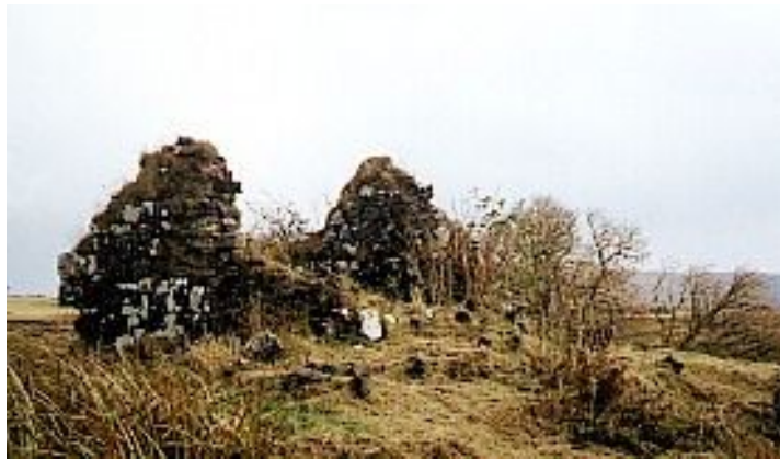
Cathedral of the Isles, Skeabost

Twenty-eight chiefs of the MacNicol or Nicolsons lie buried in holy ground on St. Columba's Isle. This seems to indicate the important role that the MacNicol clan played in the life of the Church.