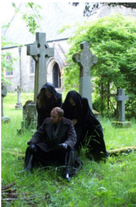
Members of the Walking Theatre Company perform "My Name is MacBeth" in the grounds of Christ Church, Lochgilphead

A select band of gentlefolk had assembled at the chosen hour, and I was much dismayed to perceive that there were but three players to perform this historical tragedy, where I wondered were the cohorts and minions, the nobles and leaders of the various factions, and was remonstrating with my companion at the lack of dramatic forces or indeed any forces, when I was forcefully hushed by my companion as the entertainment commenced.