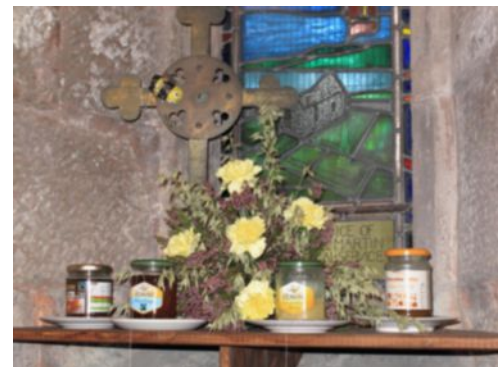
Sunday School window