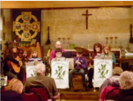
The Jaggy Thistles Harvest Concert

There was much singing and dancing in the Aisles at the recent St Columba's Harvest Festival Concert, which was part of the week long 'Harvest Festival Celebration of Island Life'.