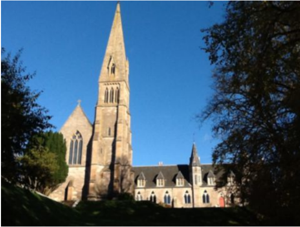
Cathedral of The Isles

The retreat is held annually in October, with limited spaces available. If you would like to know more or to enquire about attending next year (and confidential financial help is available from the Diocese for anyone who wishes to attend) please contact the Office in Oban for more information.