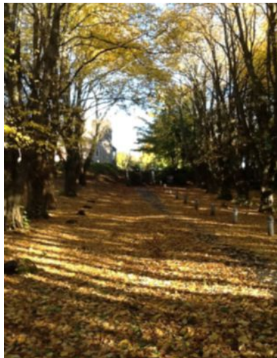
Avenue of Lime Trees in the Grounds of the Cathedral of The Isles